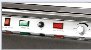
Easy-to-use control panel

Our wrapping machines feature tough aluminum and stainless steel construction with an all-stainless wrapping surface for quick and easy clean up. Each wrapper is equipped with extra large rubber feet to prevent sliding on any counter surface. All models feature a solid state controlled hot rod cut off bar and standard size hot plate with a non-stick cover.